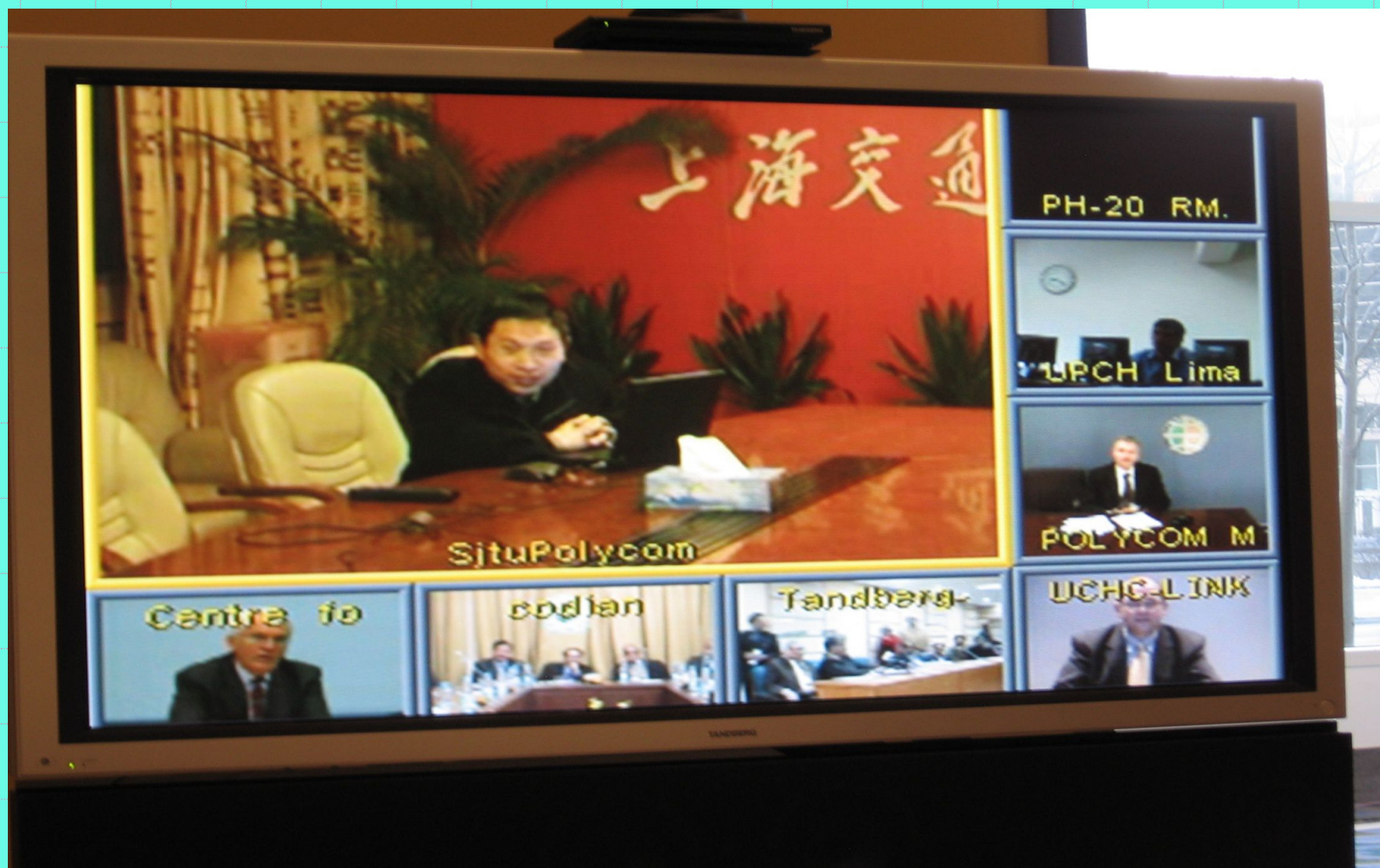
Discussion on road traffic trauma from Shanghai Jiatong University as seen at the McCormick Place in Chicago on December 5, 2006.