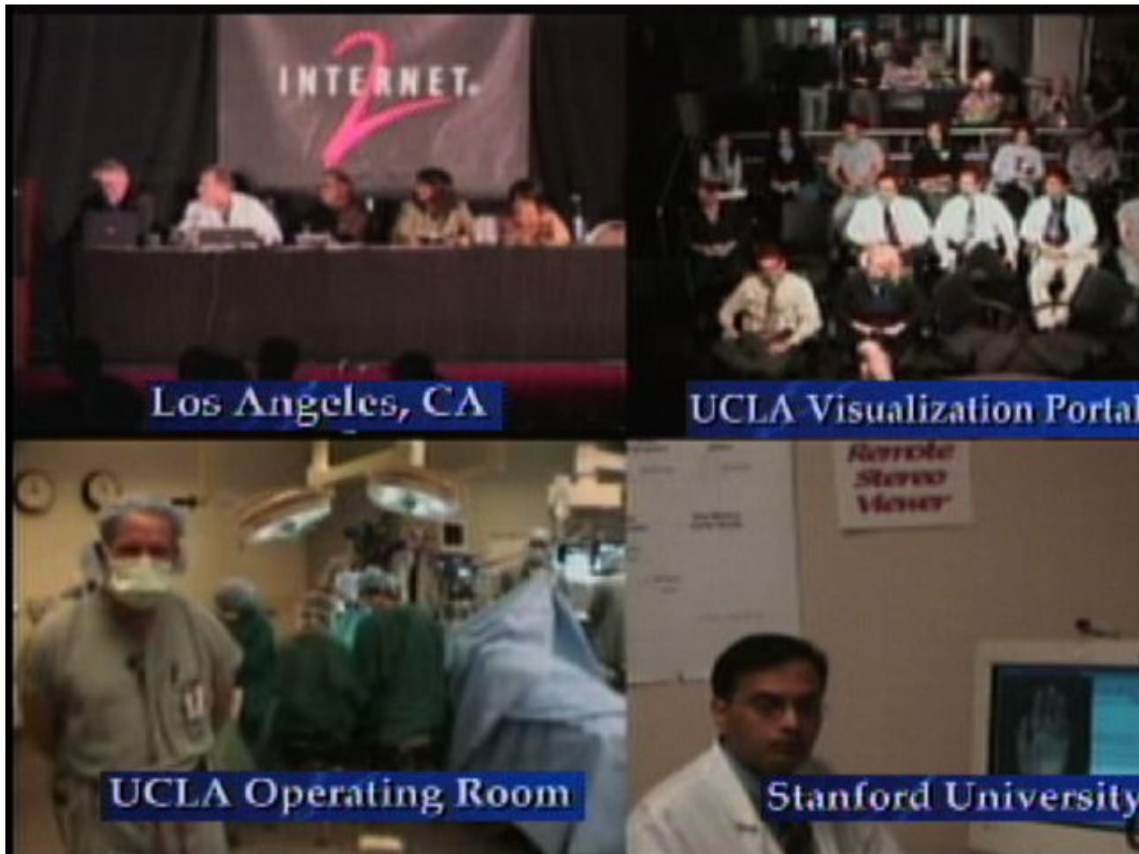
Los Angeles, CA